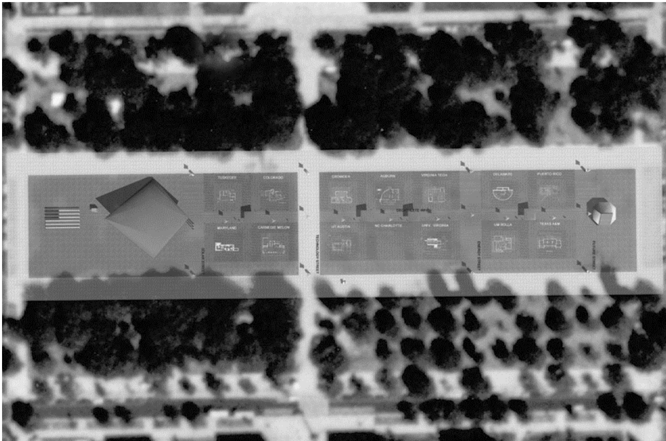
Fig. 1. Site plan of the Solar Decathlon village on the National Mall.

[3] S. Vierra and C. Warner. (1996). "AIA Solar Electric Building Programs for Architects." R. Campbell-Howe and B. Wilkins-Crowder, eds. Solar 96: Proceedings of the 1996 American Solar Energy Society Annual Conference, 13-18 April 1996, Asheville, North Carolina . Boulder, CO: American Solar Energy Society; pp. 68-71; NICH Report No. 23298.