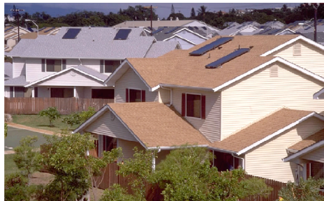
Hawaii Electric Company, Inc.

Hawaii has combined SEP funds with contributions from its partners in the construction industry, building trades, and county agencies to develop an