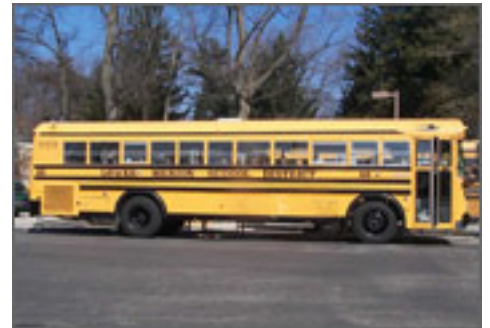
Lower Merion School District has a fleet of more than 100 CNG buses.

In the case of the Lower Merion School District in Ardmore, Pennsylvania, a journey of 6 million miles began with a single bus. In 1995, the district's first compressed natural gas (CNG) bus began serving the community. Since then, the CNG fleet has expanded to 72 buses. Over the years, the district's CNG buses have traveled more than 6.2 million miles, displacing approximately 1.3 million gallons of diesel fuel. In the 2003-2004 school year alone, the fleet logged more than 900,000 miles and used more than 180,000 gasoline gallon equivalents of CNG.