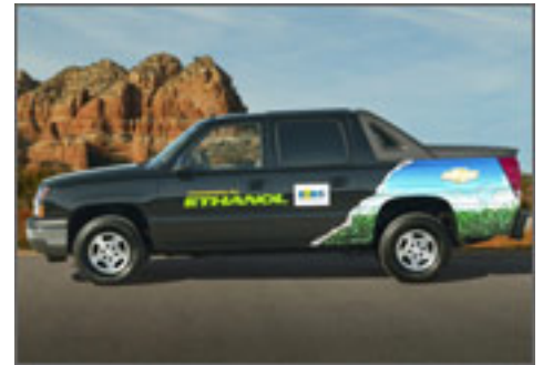
GM is offering one-year loans of Chevy Avalanche FFVs to Governors' Ethanol Coalition members. General Motors

For more information, visit the Governors' Ethanol Coalition Web site ( www.ethanol-gec.org ).