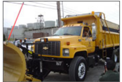
MoDOT's fleet includes 2,100 heavy-duty vehicles like this dump truck, which is fueled with biodiesel.

MoDOT uses B20 to operate backhoes, dump trucks, and heavy equipment, as well as on-road vehicles such as half-ton pickups. Its fleet has more than 4,000 vehicles, including more than 2,000 diesel vehicles.