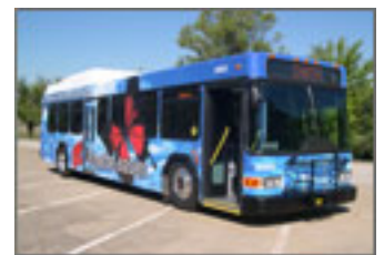
One of five hybrid electric buses acquired by the Louisville TARC last fall.

The Louisville Transit Authority of River City (TARC) last fall added five GM hybrid electric buses to its fleet. The advanced vehicles feature the slogan "Breathe Easier" and are significantly cleaner than the 1989 conventional diesel buses they replaced. TARC is a member of the Kentucky Clean Fuels Coalition and uses E85 in its administrative fleet vehicles.