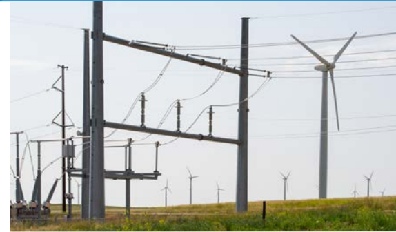
The CGI provides insights into the impact of integrating renewable resources, such as wind energy, on the grid.

For example, the CGI allows wind turbine generator manufacturers to test both the mechanical and electrical characteristics of their machines in a controlled grid environment by replicating many electrical scenarios that are only partially available in field testing. The industry now has a platform on which to ensure that renewable energy systems meet stringent national and international electrical standards and to test grid compliance of innovative electrical topologies and controls. This will increase reliability and lower the cost of energy delivered by wind and solar power. CGI capabilities go beyond fault ride-through to provide comprehensive electrical testing solutions at the multimegawatt level.