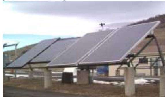
Figure 2: The SunSine™300 AC PV Module and Advanced Energy's module-scale inverter under test at NREL's Outdoor Test Facility.

mounted to an ASE Americas large-area PV module. NREL conducted accelerated environmental testing by cycling the entire AC PV Module between -40^{\circ} to +90^{\circ} C for 30 cycles of 24 hours per cycle. Measurements under Standard Test Conditions were made before and after testing. NREL reported the inverter operated at full power (250Wac) over the testing period, and no changes in performance were detected. Ascension/APC requested this test to establish a level of confidence that the SunSine™ 300's inverter would pass the same tests required for the PV module.