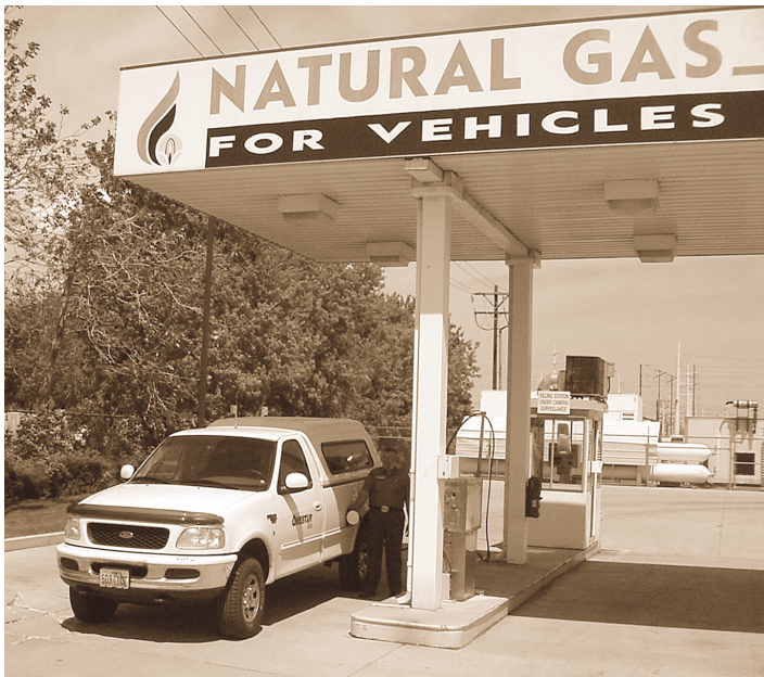
Questar Gas Company CNG vehicles fill up at public and private refueling stations throughout Utah, southwestern Wyoming, and southeastern Idaho.

in Salt Lake City. In an effort to spread the good news about the environmental and financial benefits of natural gas, the company offers alternative fuel vehicle test drives to fleet managers and provides alternative fuel information to elected officials, fleet managers, business people, and schools. Questar Gas has delivered natural gas to residential, commercial and industrial customers throughout Utah, southwestern Wyoming and southeastern Idaho for nearly 70 years.