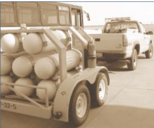
In service vehicles and ground service equipment, the incremental costs of alternative fuels can be amortized over several years.