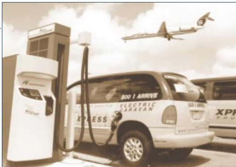
Electric shuttle buses are among the diverse mix of AFVs at Los Angeles International Airport.

To receive regulatory approval, airports located in non-attainment areas must show that their growth will “conform” with air quality plans for the region and that, at a minimum, enforceable programs will be established to offset any projected increases in pollution. Motor vehicles are typically the largest single source of pollution at airports, exceeding the contribution of aircraft.