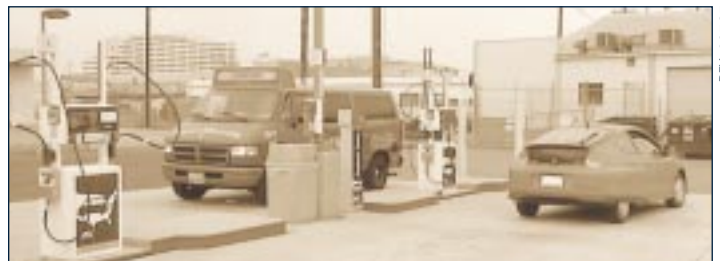
Many airports offer public access to their natural gas fueling stations.

A variety of state and private sector programs have been implemented over the last decade to reduce the incremental cost of AFVs and infrastructure. In 1999, more than $13.5 million was also made available through the Carl Moyer (state legislative) program. This is the first state-funded program in the nation explicitly earmarked for clean operating GSE. Emission credit programs have also served to make AFVs more economically attractive. SuperShuttle was the first entity to qualify for credits, which enabled it to sell the pollution reductions achieved by its AFVs to industrial sources seeking to meet their air quality obligations. To reinforce this momentum, in May 1999 LAX signed