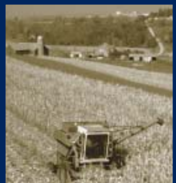
Agriculture Research Service, USDA