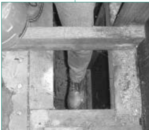
A weatherization technician illustrates a common point of air infiltration, an open chimney bypass. The crew will seal the bypass and insulate the area to reduce heat loss.

was complete, she commented, "They were thorough, friendly, and at no time did I feel degraded...thanks for perking me up, making me a believer in people again, and most importantly, for helping my heating bills. Please know that some of us out here do not expect to get a free ride, and are very appreciative of the work you do."