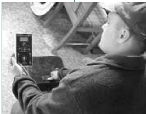
Iowa crews use a digital manometer, like this one, to identify air pressure imbalances.

Iowa's Weatherization Program recognizes that cultivating resources is crucial to success. Leveraging additional dollars from the state, utilities, and other organizations helps to enhance program capabilities. In 1999, Iowa leveraged $3 million to weatherize 1,173 additional homes.