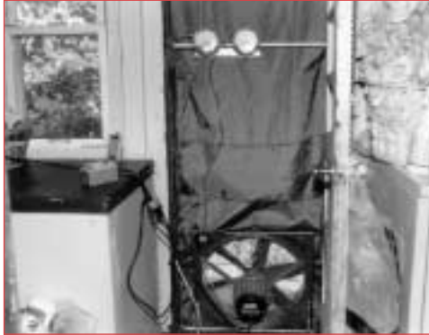
Louisiana crews use the blower door to identify and mitigate air infiltration.

Weatherization crews use energy audits and advanced diagnostic equipment, such as the blower door, to determine the most cost-effective energy efficiency measures appropriate for each home. Louisiana crews also test space heaters and cooking appliances for carbon monoxide, an odorless, colorless gas that can be deadly in large quantities. Typical weatherization services include installing insulation and mitigating heat loss through windows, doors, and other infiltration points.