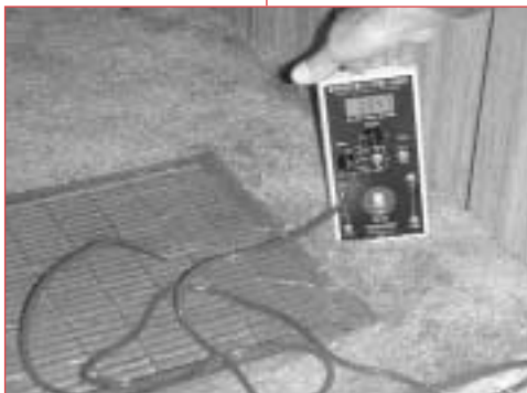
Weatherization crew diagnoses air infiltration and pressure imbalances in a mobile home.

Weatherization measures create benefits for the entire community. Up to 80% of the money spent on energy in low-income communities immediately leaves the area. By reducing energy bills for low-income families, weatherization reduces the export of energy dollars and keeps more money in the local economy, which boosts growth and creates additional jobs. Every $1 retained in the community produces an estimated $3 in multiplier benefits. Weatherization crews also serve as an energy efficiency resource to the community. Local agencies can bridge the delivery gap between federal, state, and community programs and agencies.