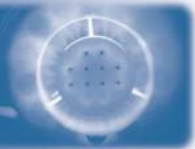
The forced internal recirculation (FIR) burner—just one of many new efficient natural gas technologies. Learn about others on page 3.