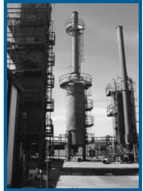
Test furnaces for high-efficiency, ultra-low-emission, integrated process heater systems.

Several field evaluations of oscillating combustion have been completed. One was on a batch-annealing furnace in a steel mill. It showed a 2% to 5% fuel savings and a 32% NO x reduction. Another was on an oxy-fuel-fired glass melter in a fiberglass plant. In this case, a fuels savings of 3% to 4%, oxygen use savings of 10% to 14%, and a NO x reduction of 55% were documented.