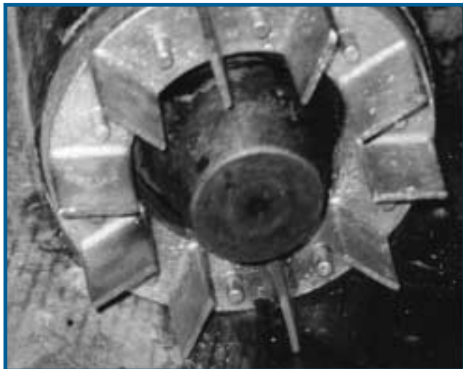
After casting, the copper motor rotor looks like this.