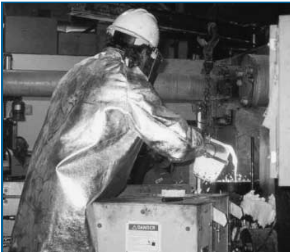
A craftsman at the Formcast Incorporated facility in Denver pours molten copper into a die form for casting.