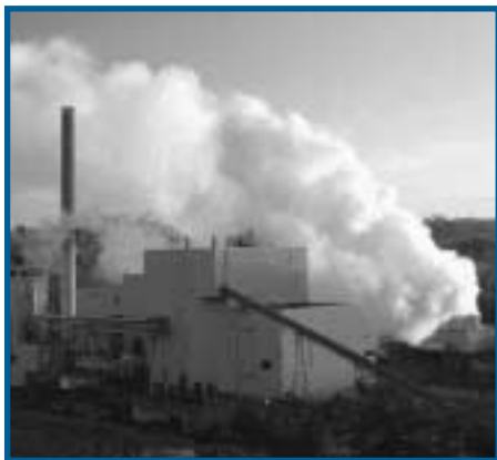
Dave Parsons, NREL/PIX 065003

The Steam System Scoping Tool software was developed by the OIT BestPractices program in 2000 to help industrial energy users improve their operations' efficiency. The software's intended audience is steam system energy managers and operations personnel for large industrial plants.