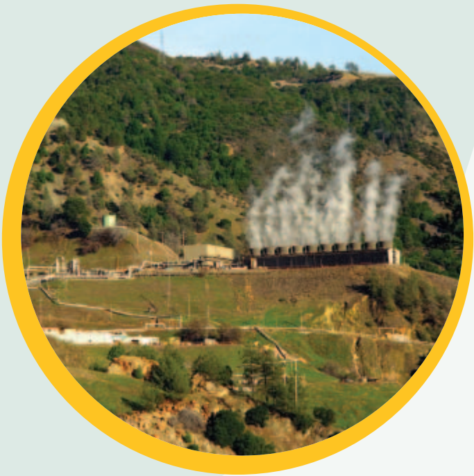
The Geysers dry steam geothermal field in northern California is the largest geothermal producer of electricity in the world. Twenty-one power plants currently produce electricity from the field.