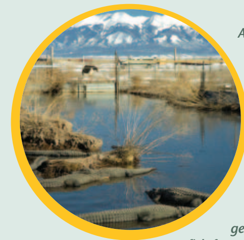
Aquaculture, or fish farming, is one of the many uses of geothermal energy. These alligators, growing in warm geothermal waters, consume waste products from nearby geothermally heated fish farms, and also provide meat and leather products.

Electricity is produced using expanding steam or very hot water from the underground reservoir to spin a conventional turbine-generator. Geothermal power plants operate at a high capacity factor, typically over 90%. Geothermal plants are among the cleanest sources of electric power available.