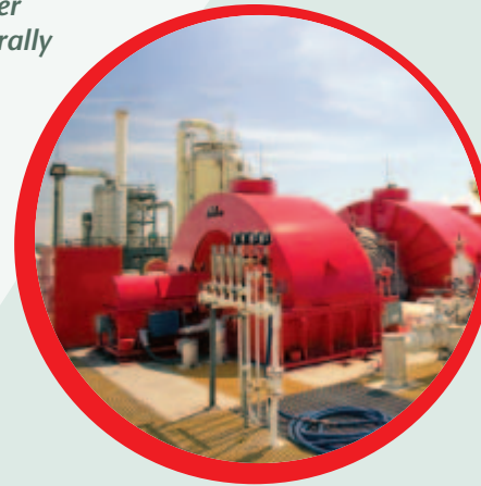
This geothermal power plant in the agriculturally rich Imperial Valley of Southeastern California produces electricity with little more than water vapor emissions.

Direct-use applications directly pipe hot water from geothermal resources to provide heat for industrial processes, crop drying, greenhouses, aquaculture, recreation, sidewalk snow-melting, and buildings. Geothermal district heating systems supply heat to multiple buildings through a network of pipes carrying the hot geothermal water.