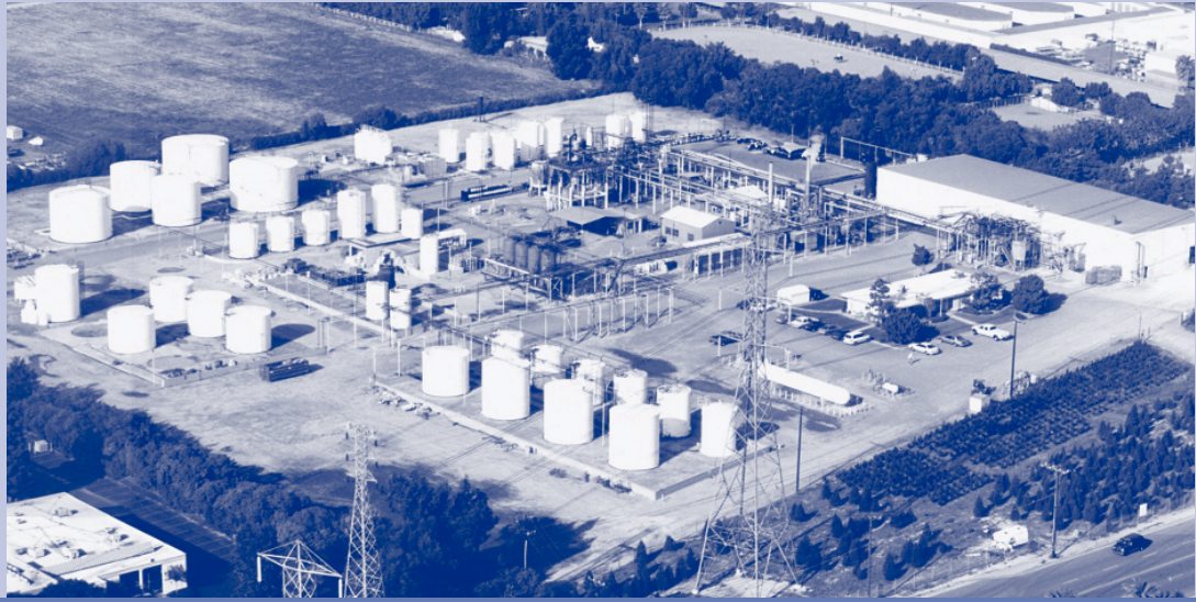
Neville Chemical Plant in Anaheim

producing smaller quantities of specialty resins. The plant operates three shifts per day throughout the year while consuming about 1.42 million kWh of electricity. The 10-acre production site has a total enclosed area in major buildings of 20,000 square feet, and the plant employs about 30.