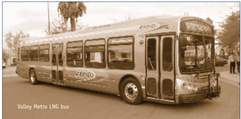
Valley Metro LNG bus

These members of Valley Metro have made significant commitments in alternative fuel infrastructure and natural gas buses that warrant their recognition as Clean Cities National Partners.