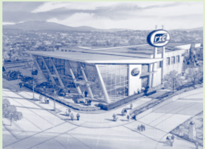
Artist's rendering of the RTC in San Diego, which opened on August 8.