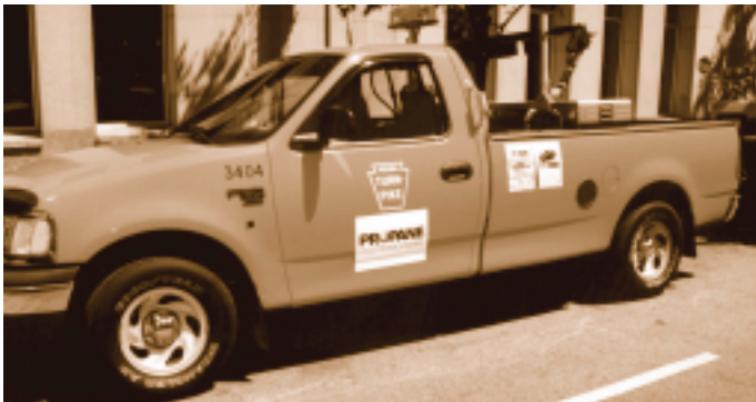
Propane-powered pickups abound on the Pennsylvania Turnpike.

EPAAct was the original motivation for the PTC's move to alternative fuels. But now it's more than that, he says. "We are very concerned and conscious of air quality, and we want to exercise good stewardship of our environment and that of our neighbors and customers."