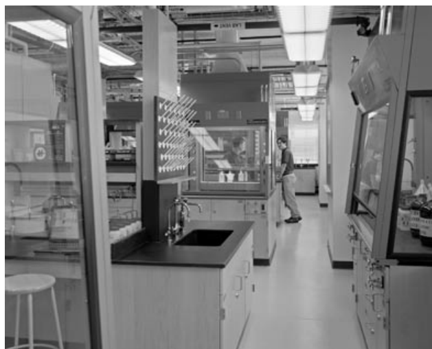
Figure 3. Double-sided fume hoods provide a clear line of sight to all student workstations in the chemistry laboratories.