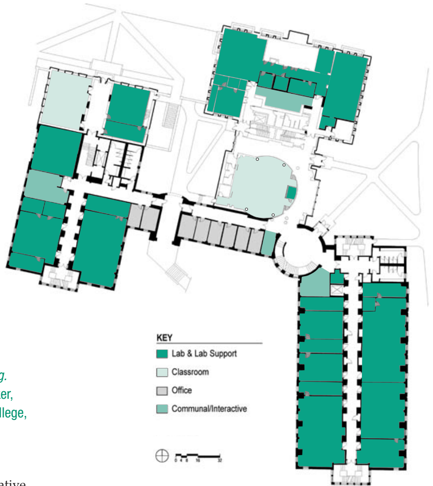
Figure 1. KINSC first-floor plan

This study is one in a series produced by Laboratories for the 21st Century ("Labs 21"), a joint program of the U.S. Environmental Protection Agency (EPA) and the U.S. Department of Energy (DOE). The program is geared toward architects and engineers who are familiar with laboratory buildings, and encourages the design, construction, and operation of safe, sustainable, high-performance laboratories.