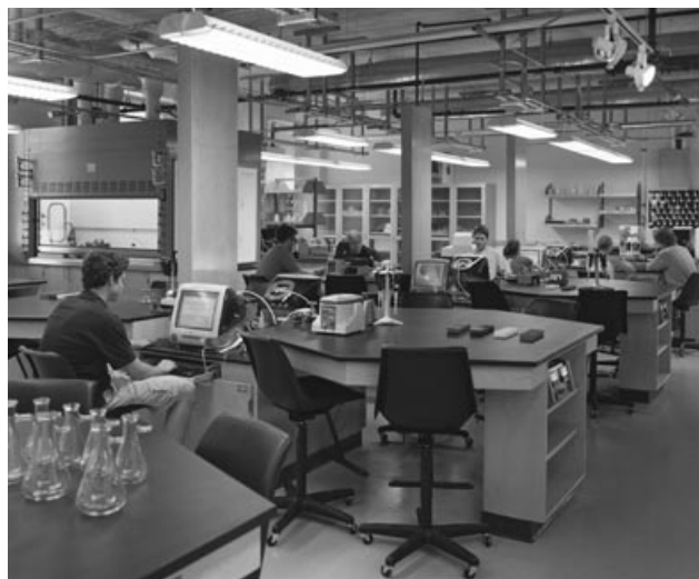
Figure 2. The bowtie configuration of the benches in the biology laboratories facilitates interactions among students.

Every teaching laboratory has Americans with Disabilities Act (ADA) accessible workstations.