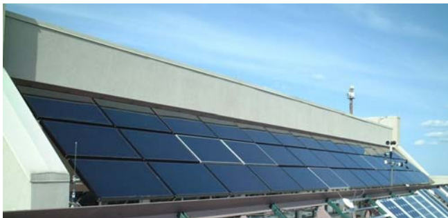
Fig. 1. 1.5-kW Solarex OTF Roof array.

NREL's OTF has the capability to do long-term performance testing of PV modules and arrays under real-world conditions. As part of the work conducted in the PV Systems Reliability and Performance R&D Task, a 1.5-kW dc photovoltaic (PV) array of Solarex MST-43MV dual-junction a-Si modules was installed and its performance monitored for almost six years (September 1999 through May 2005) at the OTF (Fig. 1). This paper describes the system and its performance based on the PVUSA power rating method.