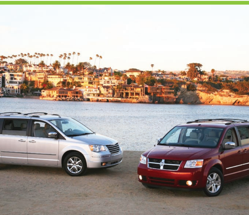
Minivans produced at Chrysler's St. Louis Assembly Complex south plant.

As part of Chrysler's energy management policy, independent evaluations are encouraged to provide fresh insights into potential energy efficiency opportunities. When a Save Energy Now analysis (based on the DOE Steam System Assessment Tool, or SSAT) uncovered innovative opportunities for energy efficiency in the steam system, the assessment team realized that these opportunities could enable them to meet corporate energy efficiency goals more quickly than they had anticipated. The company's Energy Champion worked closely with personnel in operations, maintenance, and its powerhouse to implement recommendations, and the complex's management provided full support to the Energy Champion to capture all economically justifiable opportunities.