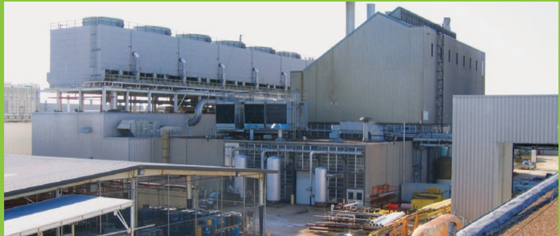
The powerhouse at Chrysler's St. Louis Assembly Complex provides steam, chilled water, and compressed air to both the north and south plants.