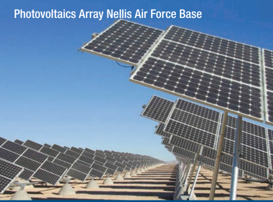
Photovoltaics Array Nellis Air Force Base