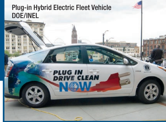
Plug-in Hybrid Electric Fleet Vehicle DOE/INEL