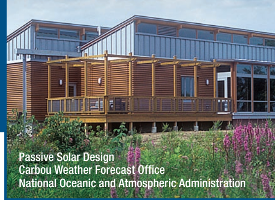
Passive Solar Design Carou Weather Forecast Office National Oceanic and Atmospheric Administration