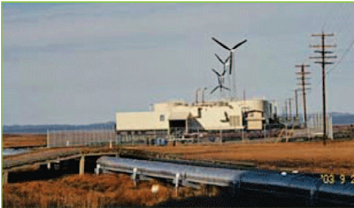
Wind turbines at Selawik.