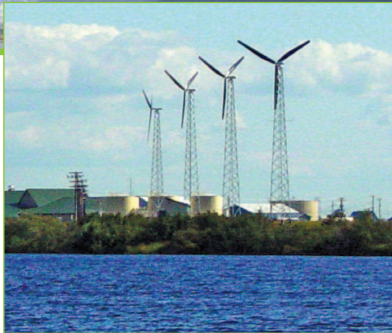
Alaska Village Electric Cooperative Inc. installed four 50-kW turbines in Selawik, which is located 3 miles north of the Arctic Circle.

The price for power in 2007 was $0.51/kWh; assuming a $110/barrel oil price, the system offers $0.69/kWh.