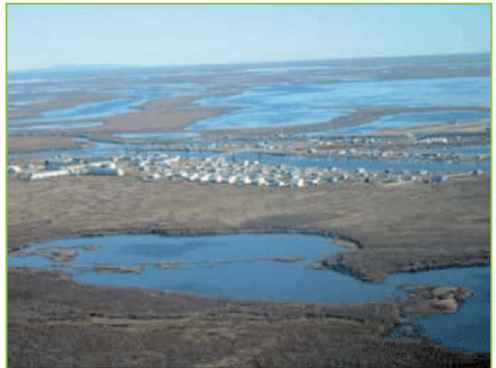
Aerial view of Selawik.