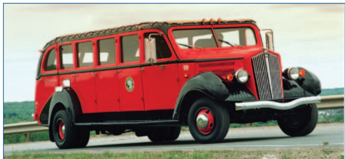
Glacier National Park fuels its Red Bus fleet with propane.

The Clean Cities National Parks Initiative was launched to help keep U.S. national parks clean and to harness the potential of parks to educate visitors about environmentally-friendly transportation. Clean Cities started the initiative by funding the addition of 20 AFVs and fueling stations in national parks throughout the country. Since then, the initiative has thrived. Clean Cities joined forces with major automakers and industry partners to promote the use of hybrids and other AFVs in parks. These efforts prompted Toyota to donate 23 Priuses and $5 million to support environmental education programs at five national parks, and a partnership with Ford refurbished Glacier National Park’s historic Red Bus fleet to run on clean