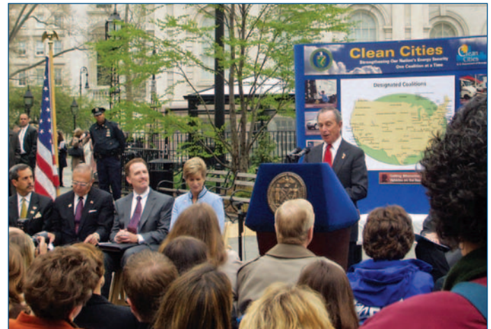
Mayor Michael Bloomberg speaks at the New York City Clean Cities coalition designation ceremony.

Clean Cities coalitions across the nation are pursuing these strategies through local efforts to build alternative fuel