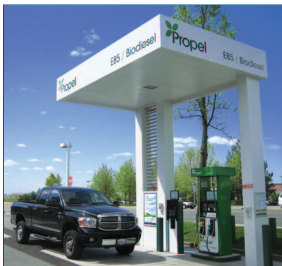
Propel Fuels opened this E85 fueling station at 6700 Five Star Boulevard in Rocklin, CA.

Non-Federal speakers must have a Federal sponsor.