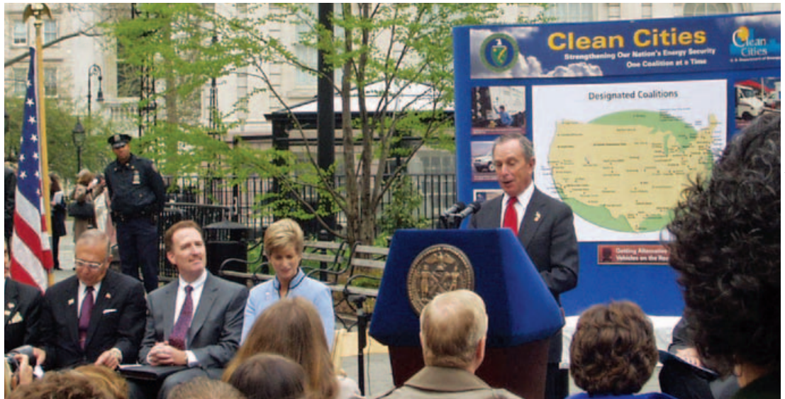
Mayor Michael Bloomberg speaks at the New York City Clean Cities coalition designation ceremony.