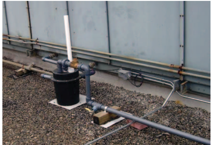
Initial piping and the condensate collector next to one air handler unit