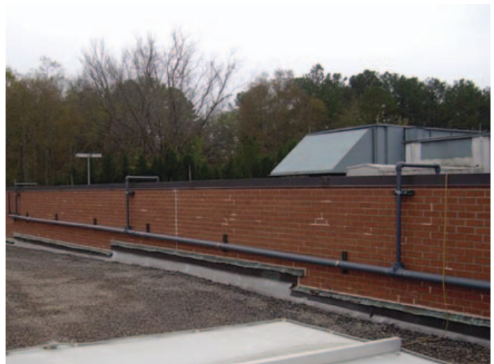
The collection manifold from each of the three units as the condensate is joined together

EPA Science and Ecosystem Support Division: PIX 16721