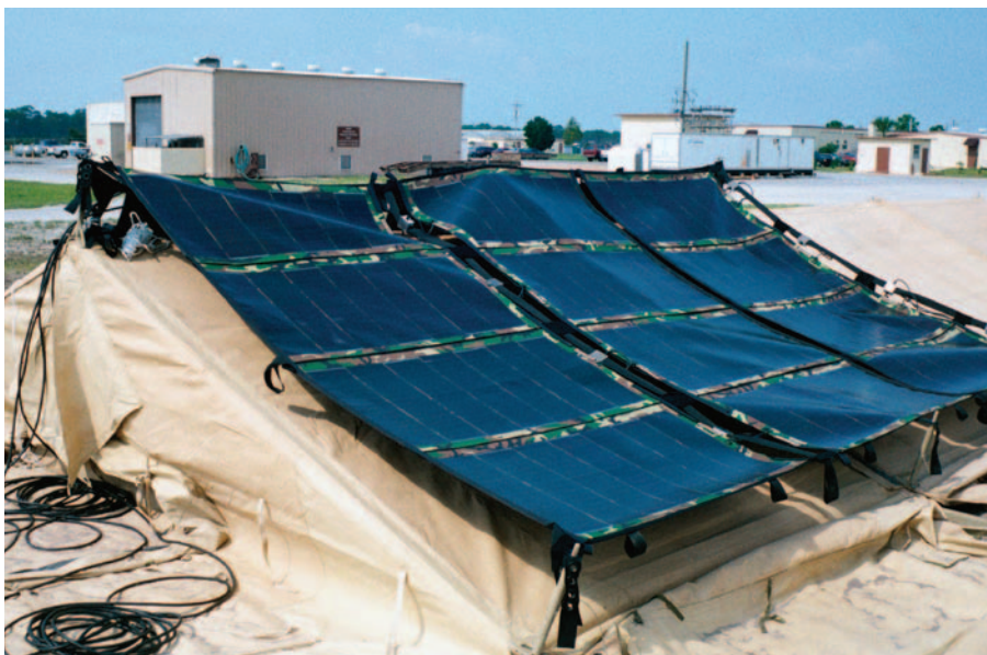
Thin-film CIGS PV makes it possible to create a lightweight power supply that can travel easily to the most remote locations and provide the energy needed to power a rapidly deployed, temporary military command center like the one pictured here. PIX 13413

This case study illustrates NREL’s innovations and contributions in Fundamental Science through Deployment.