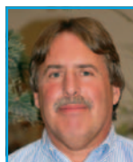
Coordinator Profile: p5