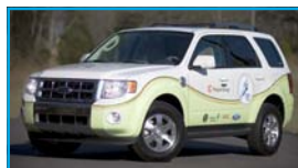
On the Road to Electrification: p6