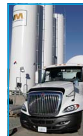
Renewable Natural Gas: p4

Clean Cities Now is published biannually. View an electronic version at www.afdc.energy.gov/cleancities/ccn . To order print copies, go to www.eere.energy.gov/library .