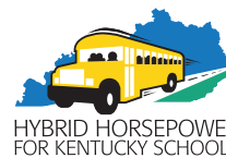
Clearing the Air in Kentucky: p10