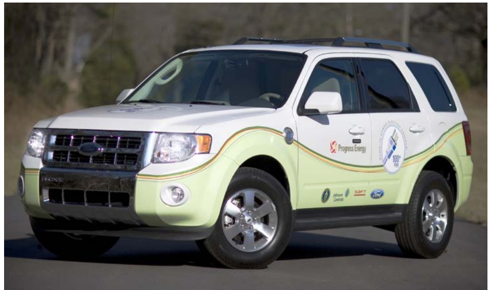
A Ford Escape PEV operated by Progress Energy, Raleigh’s utility.

Fast-growing, high-tech Raleigh—and the surrounding Research Triangle Region—became PEV leaders by joining Project Get Ready in 2009. One of the first steps was assembling a diverse