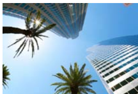
Los Angeles, CA