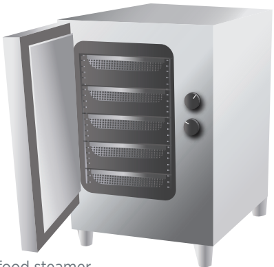
Commercial food steamer

2 Food Service Technology Center (2007). A Field Study to Characterize Water and Energy Use of Commercial Ice-Cube Machines and Quantify Savings Potential. www.fishnick.com/publications/appliancereports/special/Ice-cube_machine_field_study.pdf . Accessed December 2010.