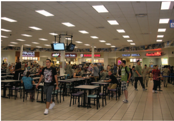
LEED Silver shopping center food court, Fort Bliss, Texas.

kitchen, the Exchange is installing more water-efficient fixtures in restrooms and, wherever possible, installing native landscaping or xeriscaping to avoid the need for a permanent irrigation system. With these new standards, a typical Exchange Food Court can reduce its water consumption by more than 220,000 gallons per year.