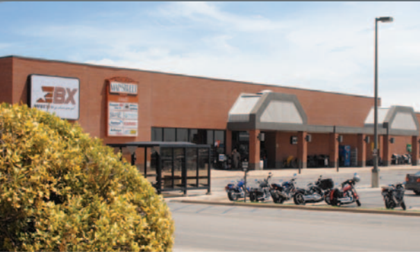
Exchange Mainstreet Mall, Goodfellow Air Force Base, Texas.

The U.S. Department of Energy's (DOE) Federal Energy Management Program (FEMP) facilitates the Federal Government's implementation of sound, cost-effective energy management and investment practices to enhance the nation's energy security and environmental stewardship.