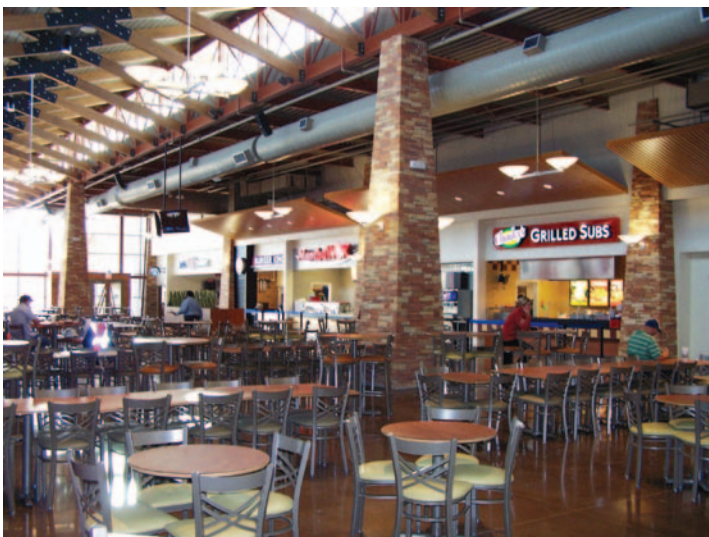
LEED Silver (pending) shopping center food court, Fort Bliss, Texas.

This case study centers on the aspects of the Exchange's sustainability plan that incorporate high efficiency commercial kitchen equipment including pre-rinse spray valves, commercial dishwashers, food steamers, and ice machines.