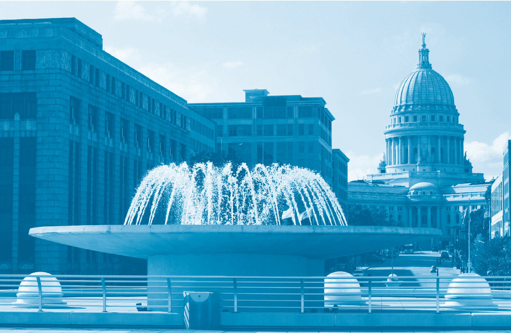
View of City of Madison.