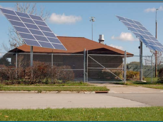
The Demetral Landfill is home to one of the first city-owned, pole-mounted PV arrays.