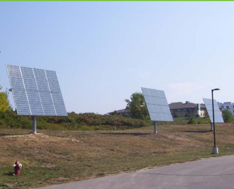
One of the first city-owned PV tracking systems is on the East Police Parking Lot. Tracking systems are built to move throughout the day to follow the sun's path, increasing electricity production.