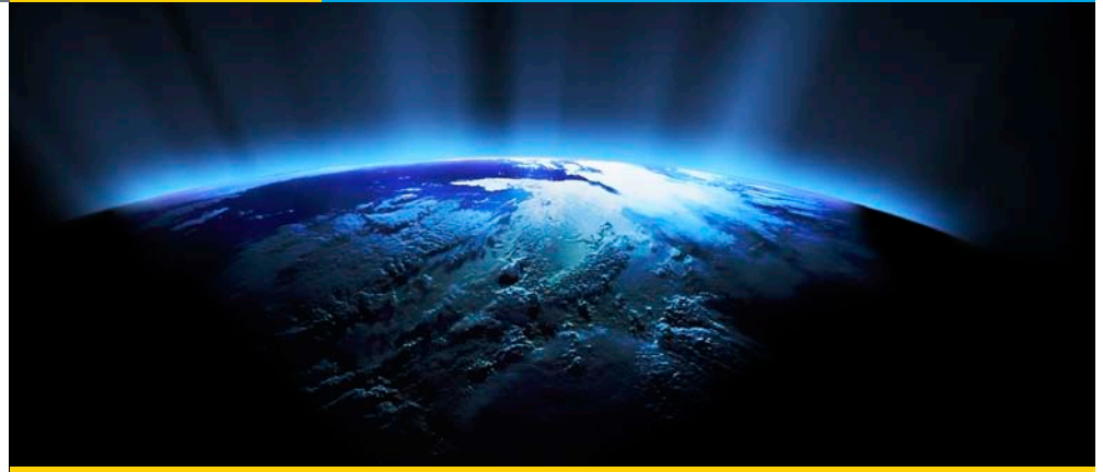
Greenhouse gases trap heat in the lower atmosphere, warming the earth's surface temperature.

The U.S. Department of Energy (DOE) Federal Energy Management Program (FEMP) assists Federal agencies with managing their greenhouse gas (GHG) emissions. GHG management entails measuring emissions and understanding their sources, setting a goal for reducing emissions, developing a plan to meet this goal, and implementing the plan to achieve reductions in emissions.