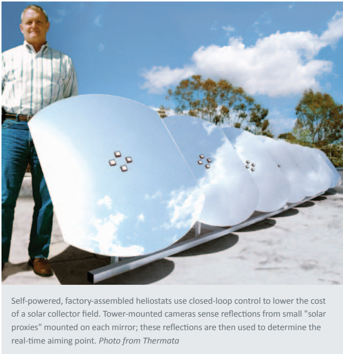
Self-powered, factory-assembled heliostats use closed-loop control to lower the cost of a solar collector field. Tower-mounted cameras sense reflections from small "solar proxies" mounted on each mirror; these reflections are then used to determine the real-time aiming point.