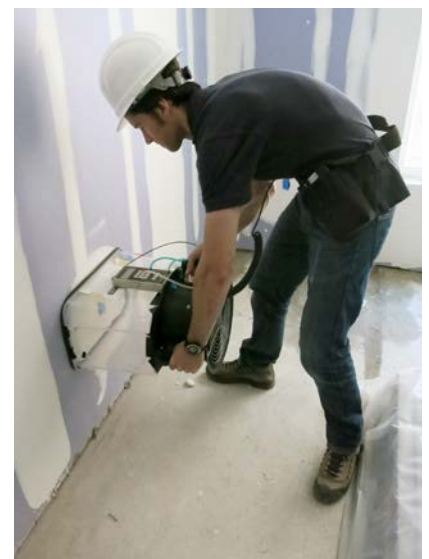
A powered-flow hood device is used to measure point-source leakage from an electrical outlet.

The aerosolized sealant proved successful by effectively sealing individual leaks that are labor intensive to address individually and diffuse leaks that are typically difficult to identify and treat. The technique proved most effective in sealing leaks from small penetrations, such as electrical outlets in the unit walls. These leaks are often easy to identify during a preliminary air leakage test, but they can be difficult to address because of their complicated geometry. The aerosol process also sealed difficult-to-reach cracks, such as those at the bottom edge of drywall at wall/floor joints.