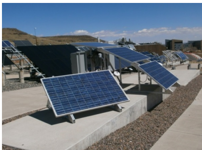
PV modules with micro-inverters installed at NREL. Three PV modules are south-facing, with tilts of 10°, 25°, and 40° from the horizontal. A 4th PV module is tilted 40° and faces 30° west of south. A 5th PV module (not shown) is installed on a nearby two-axis tracker.

We designed the validation experiment to include five identical PV module/Enphase Energy Inc. micro-inverter systems, each with a different tilt and azimuth orientation. Each of the five systems is instrumented to measure the P_{ac} and GTI for comparison with the modeled values. The existing DNI and DHI measurements from the NREL's Solar Radiation Research Laboratory are also used for comparison with modeled values.