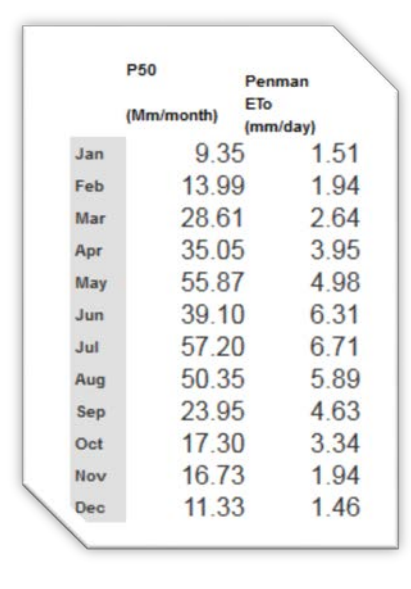
Figure A.2.2. Example of IWMI Climate Variable Outputs Needed for Normalization

The following covers the IWMI web-based tool outputs needed for normalization as discussed in Section 5.3.