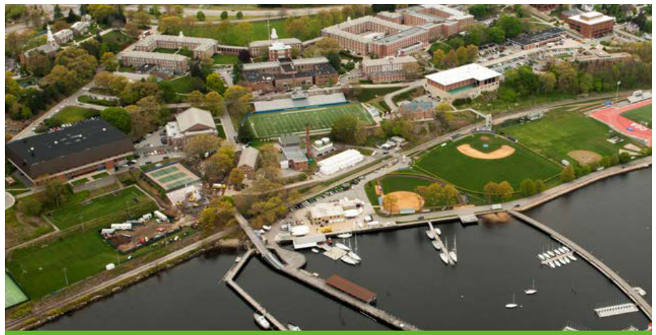
Figure 1. U.S. Coast Guard Academy campus.

The project team developed and executed the UESC project to meet several priority objectives, including implementing essential infrastructure improvements, increasing reliability, and enhancing resilience. The team used a comprehensive approach, producing a 30-year forecast of the academy's energy and water demands and then prioritizing efficiency opportunities, maximizing available funding sources and financial incentives, and seeking to incorporate renewable energy. The investigation identified