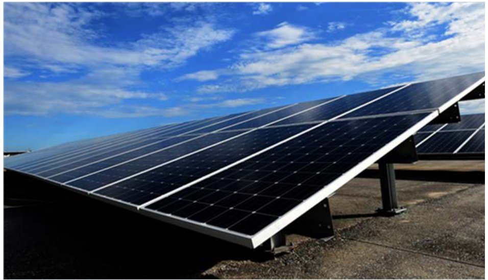
Figure 1. Solar array at the Naval Construction Battalion Center in Gulfport, Mississippi.

NCBC Gulfport is the base of operations for the Atlantic Fleet Seabees and supports the operation and mobilization of Naval Construction Force units. Located on the Gulf Coast