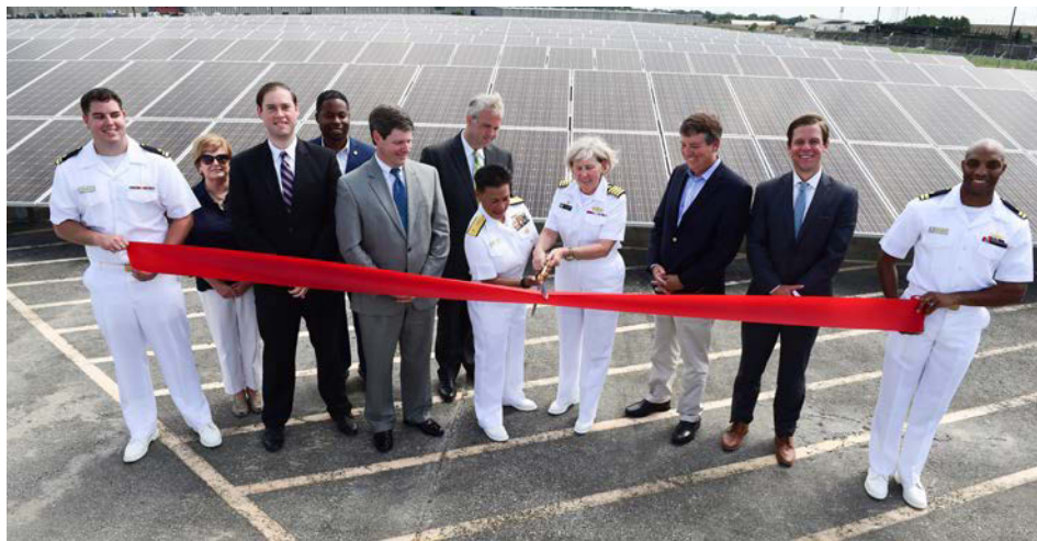
Figure 2. The ribbon-cutting ceremony for NCBC Gulfport’s 13,000-module solar facility, which began sending electrons to the grid in early 2017.

For questions about UESC technical assistance, contact Tracy Niro at 202-431-7601 or Tracy.Niro@ee.doe.gov . ■