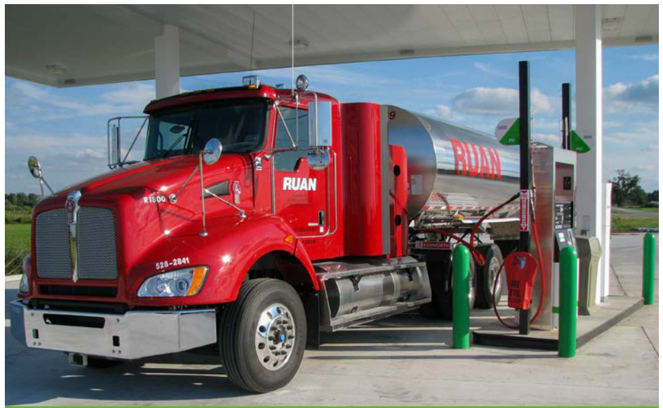
A Ruan milk transport truck fuels up at an ampCNG renewable natural gas (RNG) station in Indiana. The RNG is produced from cow manure—from the same cows that produce the milk.

VTO designated the first Clean Cities coalition in 1993 in response to the Energy Policy Act of 1992, and coalitions across the country have evolved and expanded ever since. After a quarter century, coalitions have garnered the respect and trust of fleets and industry alike by providing objective data and real-world lessons learned to smooth the transition to alternative fuels and advanced vehicle technologies. Coalitions accomplish this in communities large and small, one project, one local decision, and one