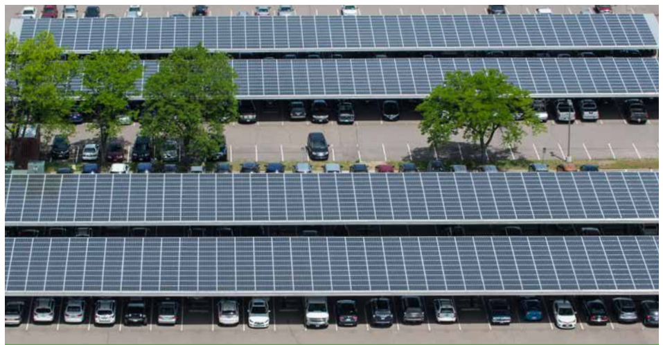
Figure 1. A solar carport may be implemented under an ESPC ESA.