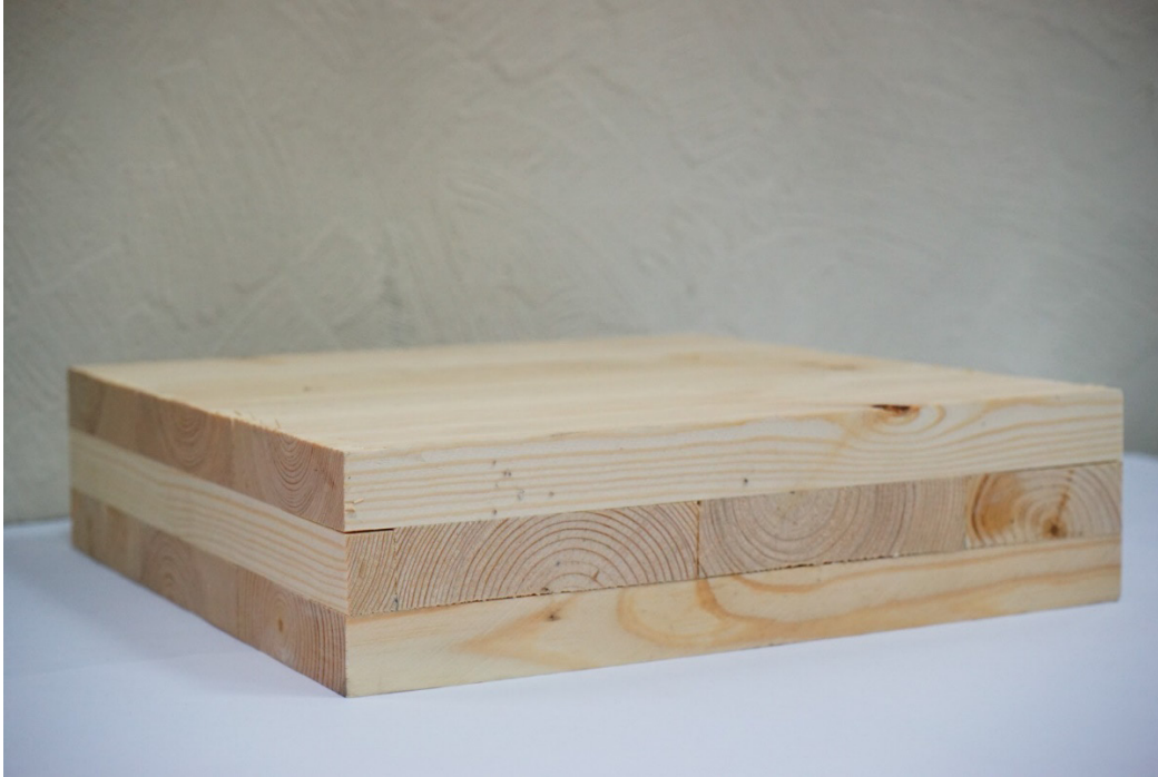
Figure 1. Perpendicular grains of alternating lumber boards used for CLT panels