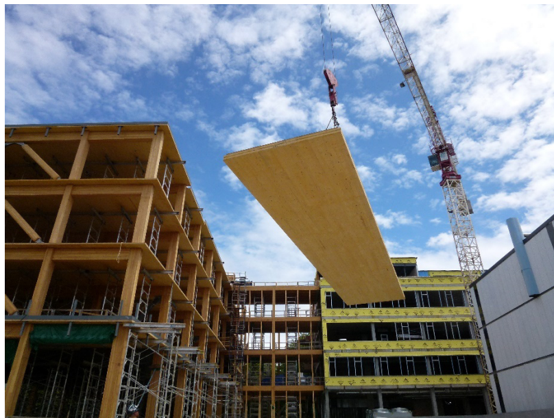
Figure 2. Construction using CLT panels

Given the breadth of research possible in CLT buildings, construction, manufacturing and associated activities, this workshop sought to capture targeted research and deployment opportunities across the life cycle of CLT buildings. The following sections describe the structure and discussions from the workshop.