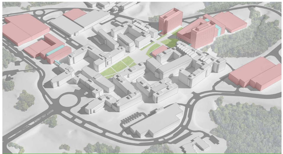
Figure 1. The Food and Drug Administration (FDA) Federal Research Center in Silver Spring, Maryland (proposed future buildings in pink). FDA used an energy savings performance contract (ESPC) to install a 60-MW microgrid capable of operating the campus regardless of disruptions to the external utility grid.

While microgrids provide benefits over traditional backup generators, they are typically more complex and can be expensive to install. However, certain components of a microgrid (and