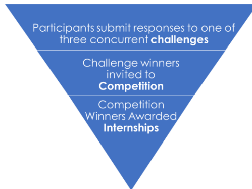
Fig. 1. Schematic of JUMP into STEM competition format.

From the challenge submissions, winners are chosen. Eligible challenge winners are invited to a competition. At this competition, they present their challenge submissions and network with researchers and industry professionals.