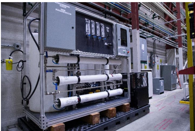
Fig 2. NREL's RO membrane evaluation experimental setup

The lack of validated assumptions represents a significant risk to marine energy technology developers pursuing desalination. To address this, NREL and WPTO have embraced an R&D philosophy intended to uncover showstoppers instead of advocating for a specific technology type. This R&D philosophy is rooted in systems engineering principles namely that any multidisciplinary system should be conceived, designed, and developed as a whole solution [8]. However, given that many of the system inputs for marine energy are still in an early stage of development, an incremental approach