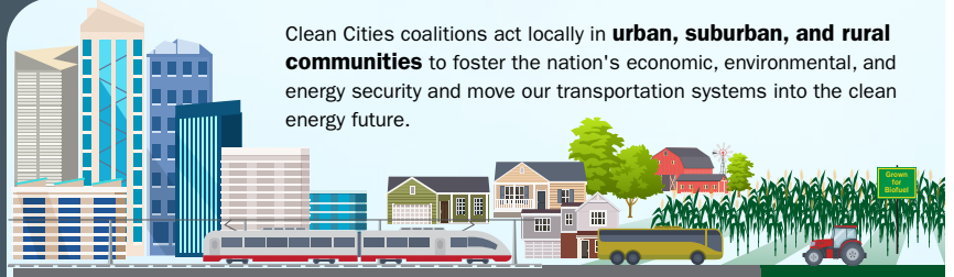
Illustration by Al Hicks, NREL

Clean Cities coalitions act locally in urban, suburban, and rural communities to foster the nation's economic, environmental, and energy security and move our transportation systems into the clean energy future.