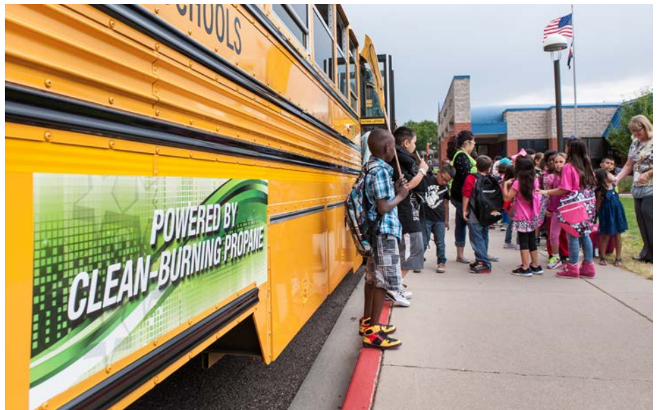
Switching to clean school buses with low or no emissions can help improve air quality around schools, benefiting the health of students.

Coalitions are instrumental in bringing clean transportation technologies to communities large and small, one project, one local decision, and one fleet at a time. Together, they create a compounding impact nationwide that advances U.S. energy independence and reduces vehicle emissions while supporting regional economic development and job growth.