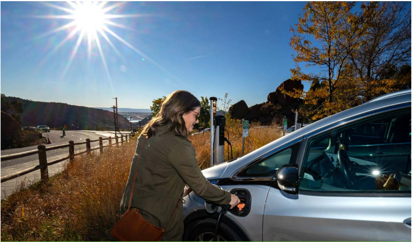
More fleets and consumers are choosing electric vehicles as new, competitively priced models with longer ranges hit the market and additional public charging stations are rapidly becoming available.