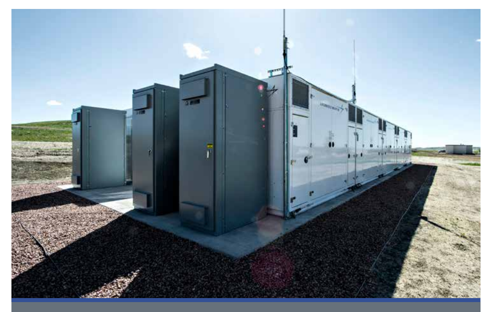
Figure 1. Fort Carson is the tenth-largest military base in the United States, home to 13,000 troops and more than 900 facilities. FEMP helped Fort Carson leverage performance contracting to integrate energy efficiency with an 8.5-MWh battery energy storage system and peak-shaving controls. As a result, Fort Carson benefits by saving approximately $500,000 per year on its electric bill.

We convene key partners, share best practices, promote sustainable technologies, and advance the market.