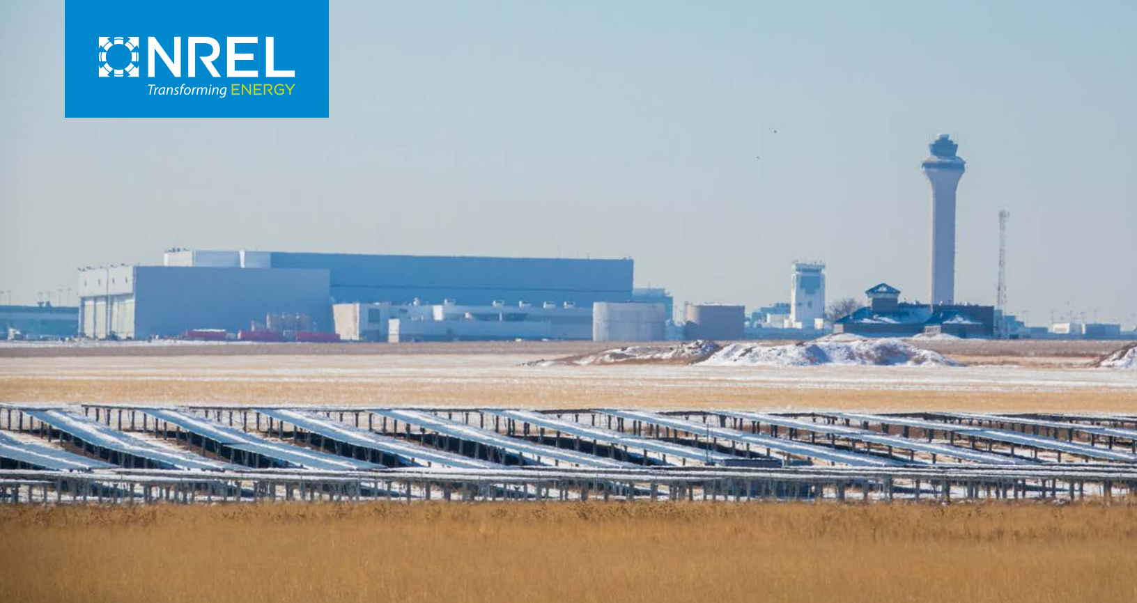
Photo from Denver International Airport