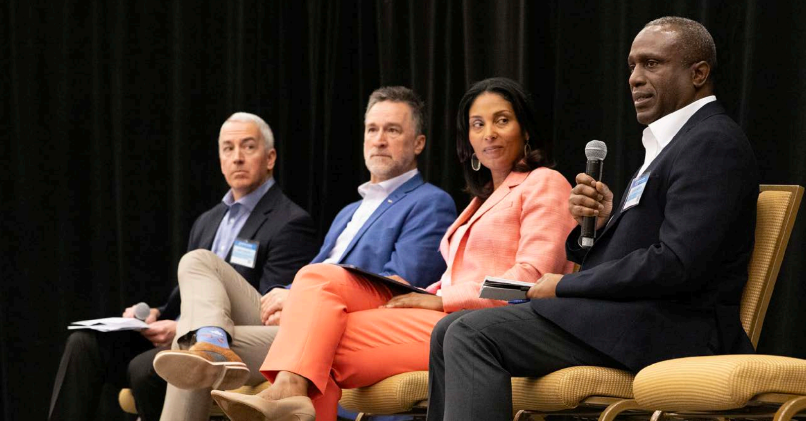
Sponsored by DFW International Airport and hosted by NREL, the 2024 Sustainable Aviation Energy Conference brought federal agencies and industry leaders to the whiteboard to find focused collaboration areas that can accelerate existing federal, state, and industry programs.