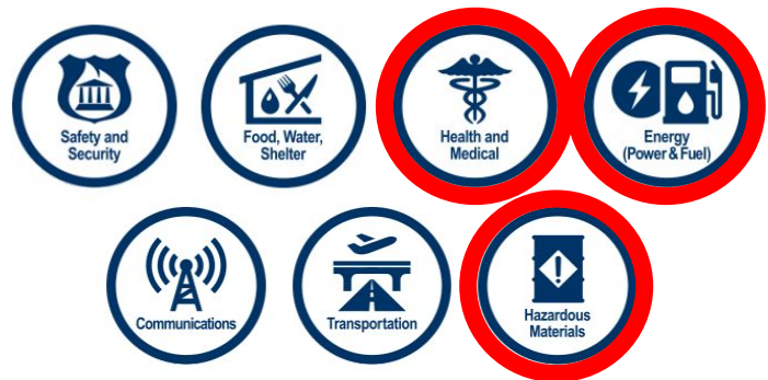
Figure 1. The FEMA Community Lifelines associated with Pinellas County's Waste-to-Energy plant.

The electricity produced from the WTE plant powers around 45,000 homes and businesses every day. Staff reported the influential role of the FEMA Community Lifelines (Figure 1) in providing a lens in which to consider the impacts of a loss of critical facility services within the community during a disaster event across multiple sites.