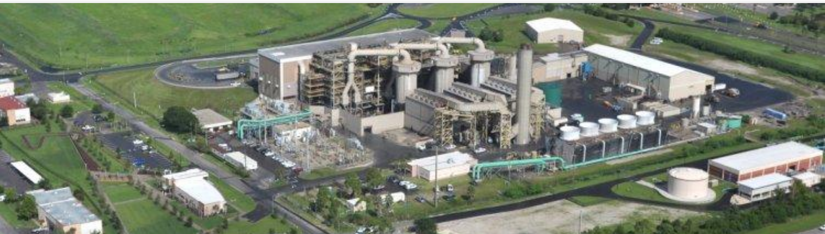
The Solid Waste-to-Energy Plant burns approximately 3,000 tons of garbage daily and converts it into up to 75 megawatts per hour of useful energy.