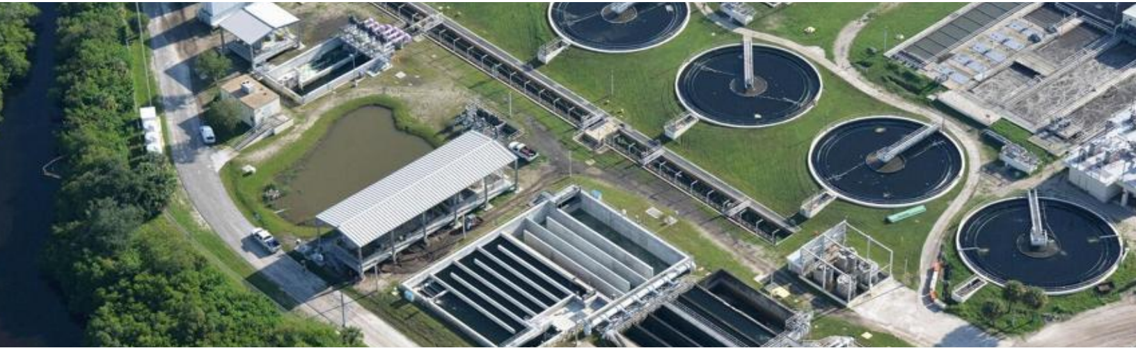
The City of Largo Wastewater Treatment Facility [Credit: City of Largo]