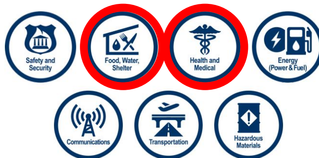
Figure 1. The FEMA Community Lifelines associated with the City of Largo Wastewater Treatment Facility.

For the City of Largo, the Decision Support Template proved useful for evaluating solar and storage at individual buildings within the WWTF complex. However, structures such as processing tanks, which many not have roofs, will need further analysis to determine the structural support needed for PV systems and equipment.