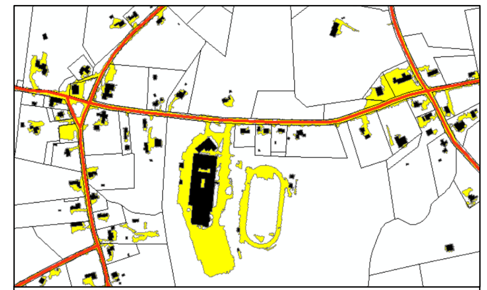
Figure 3. Example parking lot geospatial data showing impervious surfaces in yellow and roads in red. Building roofprints are shown in black. The large building at center is a regional high school with a large paved parking lot to the rear.

scan the data layer in a GIS program at a relatively fine scale (e.g., 1/8 of the municipality at a time) to identify large areas of impervious surfaces. These areas can then be checked against satellite imagery to ensure they are in fact parking lots. Measurement tools (such as the Measure feature in ArcGIS or the Measure Area feature in QGIS) can then be used to outline the parking lot and