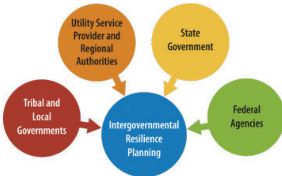
Figure 4.3 Intergovernmental resilience planning

https://www.nrel.gov/docs/fy19osti/73509.pdf